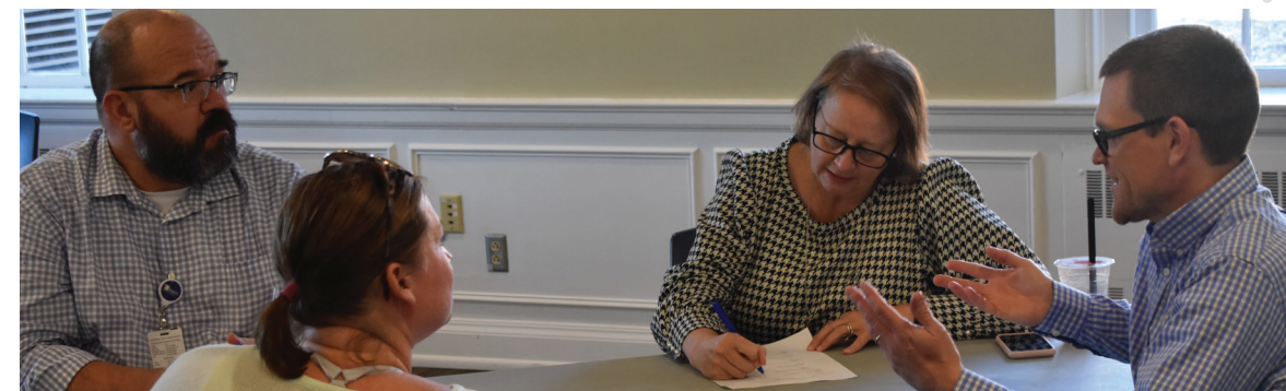
Psychological Safety session

“ Subtraction significantly shifted my way of viewing problem-solving. ”