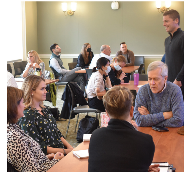
Subtraction Thinking session

OE sponsors the UVA institutional membership providing access to NCCI learning resources and a network of colleagues from across the nation. More than 200 UVA faculty and staff hold an active status with NCCI and have engaged in formal programs of communities of practice, webinars led by higher education thought leaders, and the annual conference.