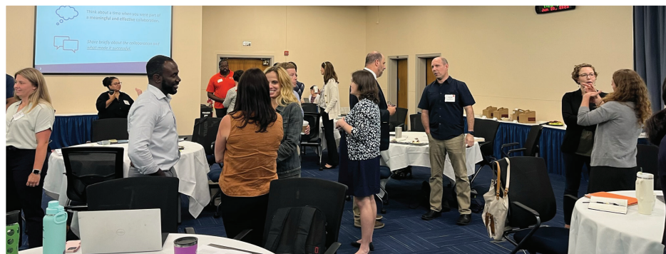
Top: Clinician's Eye session; bottom: Cornerstone Leadership session

“ Great information in a wonderfully approachable format ”